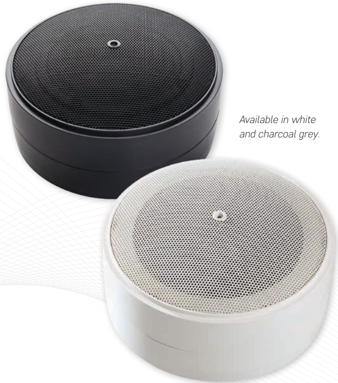
Available in white and charcoal grey.

Install loudspeakers upward-facing, either above the ceiling treatment or within an open ceiling. The indirect transmission of the masking sound results in broad, uniform coverage. Downward-facing, wall-mounted and under-floor models are appropriate when installation conditions necessitate their use.