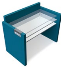
Workstation and adjustable height desk