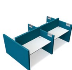
Cluster of 4 back to back workstations