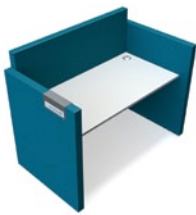
Workstation and fixed height desk