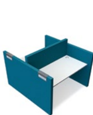
Double back to back workstation