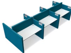
Cluster of 6 back to back workstations